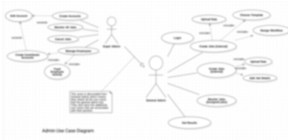
Figure 2 - Use Case Diagram

An example of a use case diagram is shown above. Such a diagram shows how different users of the system (known as actors) interact with the system in order to achieve specified goals.