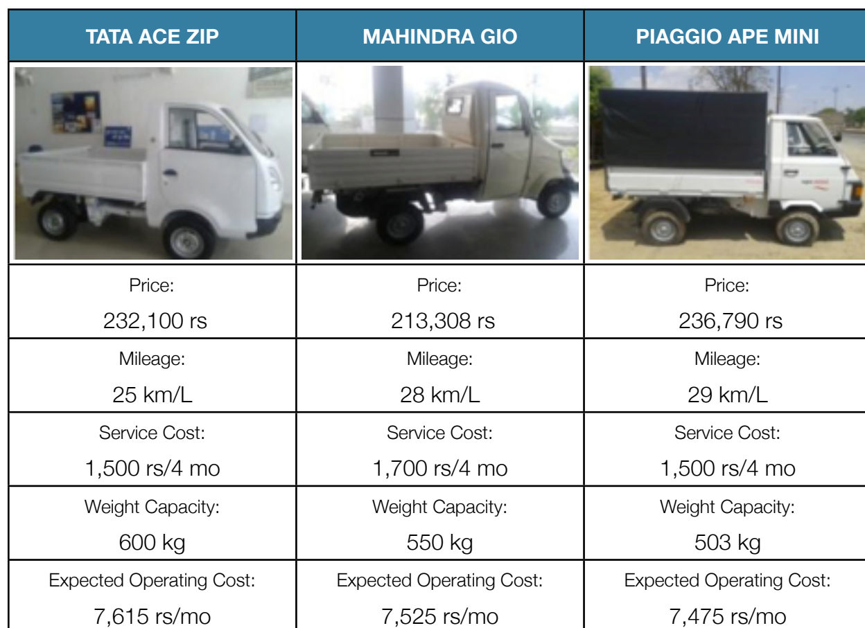
Figure 4: Four Wheeler Specifications for Vehicle Investment

Figure 4 presents the cost breakdown and productivity metrics for the 3 best vehicle upgrade options to be implemented at one per block. Their price, mileage, cost of maintenance (once every 4 months or 10,000 km), carrying capacity, and monthly operating cost (including service and fuel expenses) are displayed for comparison.